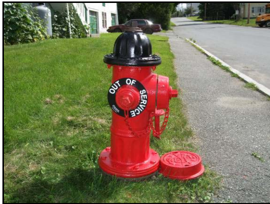
Figure 1. Hydrant Maintenance

R.E.A. provides routine operation and maintenance (O & M) services for several public community water systems throughout central and northeastern Vermont. The systems include small towns, schools, office buildings and convenience stores. Routine O & M services involve periodic inspection of the various water system components, monthly sample collection, equipment maintenance, reporting & trouble shooting.