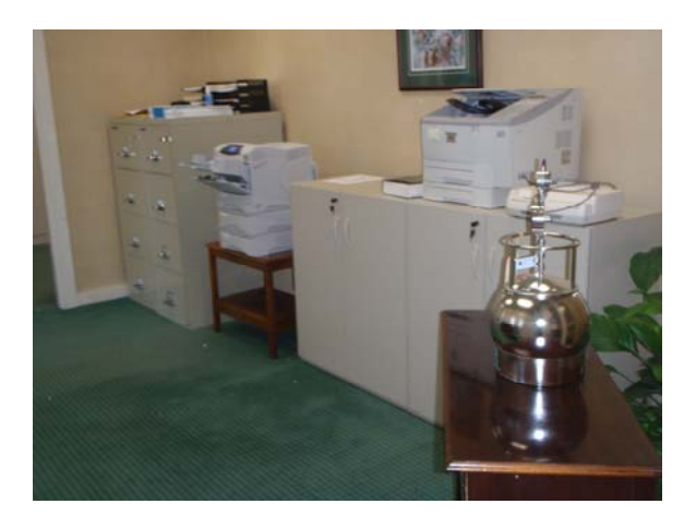
Figure 3 . SUMA Canister used for collecting 24-hr composite indoor air sample