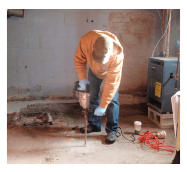
Figure 1 . Installing vapor sampling point beneath a concrete floor

Vapor intrusion occurs at sites contaminated with volatile chemicals such as gasoline and dry cleaning solvents where contaminated vapors migrate from the subsurface into overlying buildings, basements and utility corridors. During a routine inspection of a residential basement adjacent to a gasoline station, R.E.A. personnel noted slight petroleum odors. Upon further inspection, elevated PID readings were noted along cracks in the foundation.